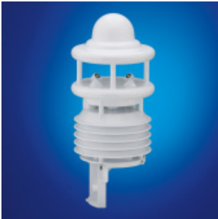
WS600-UMB compact weather station for air temperature, relative humidity, precipitation intensity, precipitation type, precipitation quantity, air pressure, wind direction and wind speed.